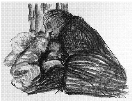
City Shelter, Kathe Kollwitz, 1926, public domain

The observances of Tish'a B'Av —not wearing fresh clothes, not washing, fasting from eating and drinking and sexual contact, not greeting each other, not sitting anywhere except on the ground-are closer to the experience of being a refugee than to being a mourner. The destruction of the Temple stands not just for the destruction of Jerusalem, but for the city being turned into a war zone, and the people becoming prey to hunger, violence, and death. Tish'a B'Av is not primarily about the Temple - Chaza"l, the rabbis, figured out how to live without the Temple long ago. Rather, Tish'a B'Av is about homelessness, fleeing from war into famine, being thrown into a hostile world without shelter or protection - things all too present in our world. It's an opportunity empathize, to confront the ways we abuse our power, as individuals, as a society, as a people, and as a species, turning other people and other species into refugees.